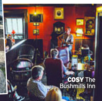
COSY The Bushmills Inn

Portstewart's front nine holes career naturally through some of the most fabulous dunes, making it crazy golf on a grand scale. Castlerock is less renowned, but no less worth a visit. The clubhouse is smaller and somehow more intimate, the welcome is warm and genuine -